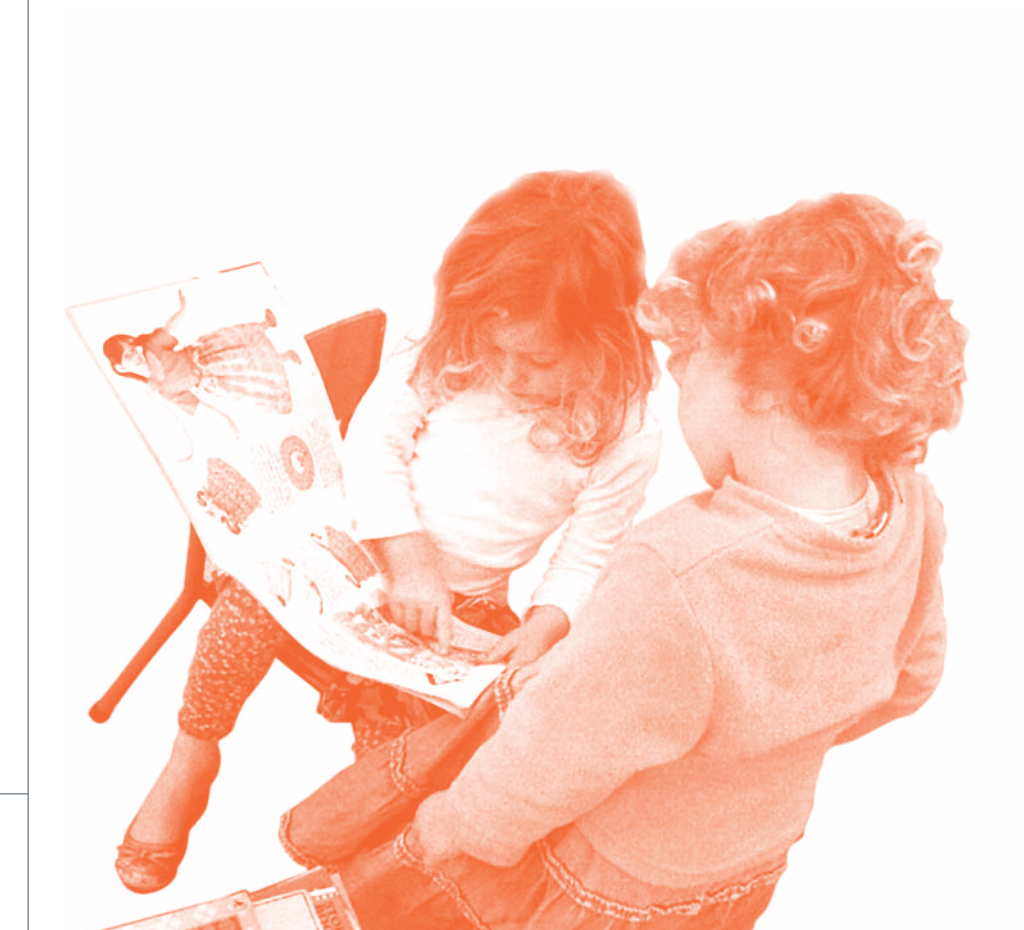
2 Ministry of Education. (1996). Te Whāriki, He Whāriki Mātauranga mō ngā Mokopuna o Aotearoa, Early Childhood Curriculum. Wellington, New Zealand: Learning Media.

While Te Whāriki does not specifically advise educators how to promote or teach early literacy, Strand 4, Communication-Mana Reo, does state that the languages and symbols of children's own and other cultures are promoted and protected in ways that seek to empower children to become literate through activities that are meaningful and engaging. It encourages an holistic view of literacy where infants, toddlers and young children engage with literacy in ways that reflect their growing expertise, and that incorporates their home literacy practices.