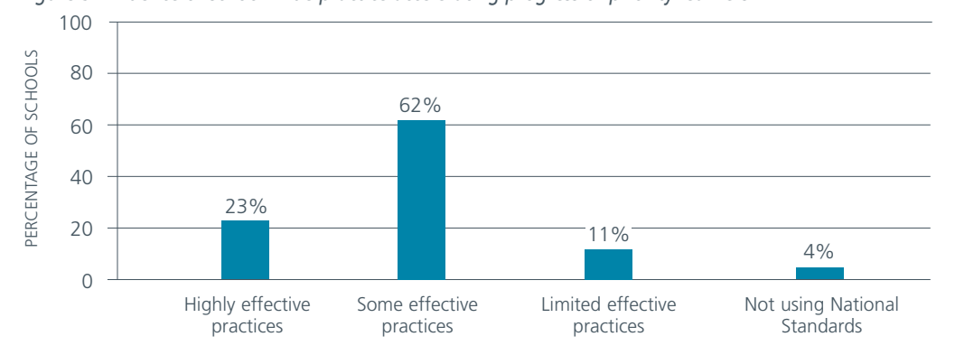
Figure 3: Evidence of school-wide practice accelerating progress of priority learners

7 This table is based on the BES and ERO's evaluation indicators.