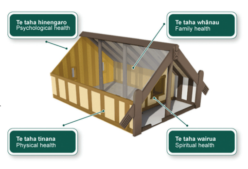
Figure 1: Te Whare Tapa Wha Model

Despite the recent currency of social determinants of health, the foundational concept of health as socially determined predates the work of McKeown. Many nonwestern societies and indigenous communities have always viewed health as a holistic phenomenon. For example Mason Durie's Maori health model Te Whare Tapa Wha based on the image of a Maori whare (house), as shown below in Figure I, illustrates that the four cornerstones of Maori wellbeing are whanau (family health), tinana (physical health), hinengaro (mental health) and wairua (spiritual health).