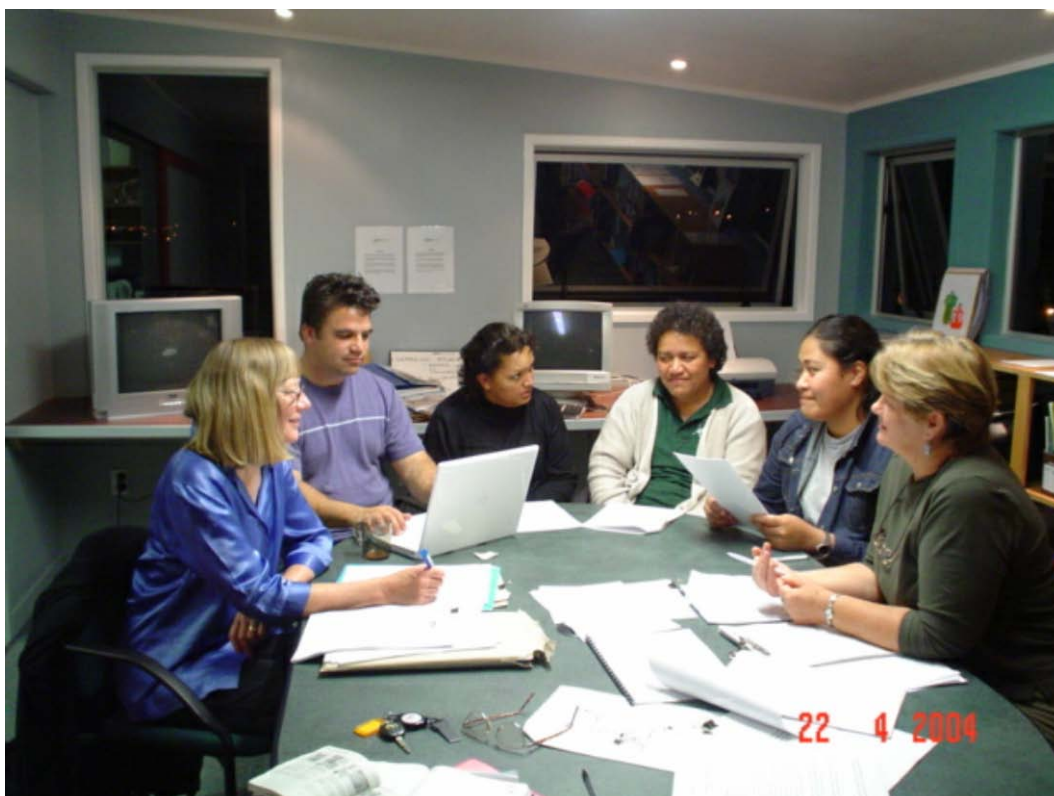
Photo 4: The A’oga Fa’a Samoa COI focus group: Some key members 2003-2006

An initial advisory group (convened 20 February 2003 to consult and finalise the research proposal) continued to provide advice for the research project. Several key interviews/discussions of the focus group yielded useful data for the study. In-depth discussions around the focus group topics/questions provided background information pertaining to the first research question: “What helps learning and language continuity as children make transitions within and from the Samoan language immersion centre?”