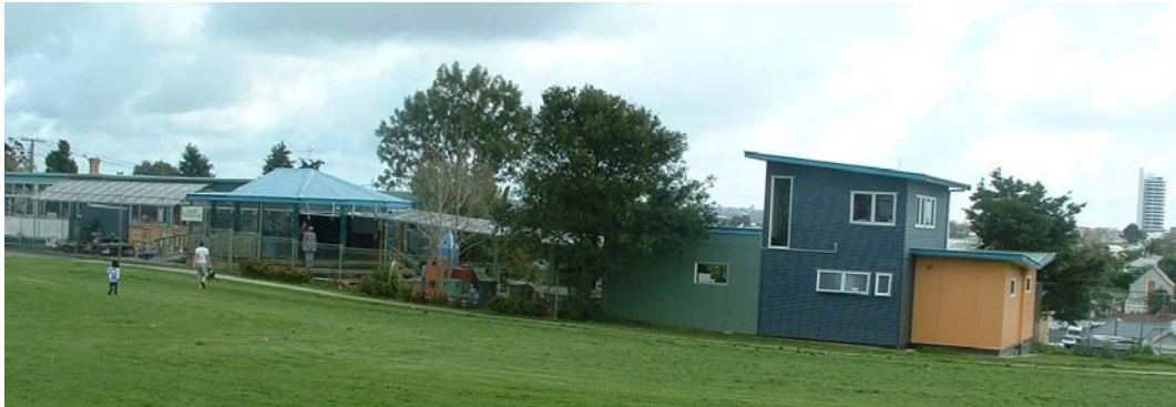
Photo 1: The A’oga Fa’a Samoa (2003) located on the site of the Richmond Road Primary school grounds.