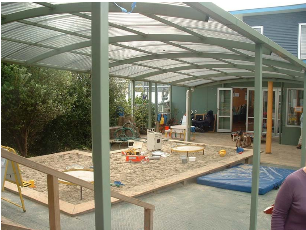
Photo 2: The A’oga Fa’a Samoa, showing the covered way linking the under-2½ building to the over-2 building, with the sandpit as the focal play and meeting area.

In 1984 in Auckland a group of grandparents and interested parents set up an incorporated society “A’oga Fa’a Samoa”, found premises, and started the first Samoan early childhood education centre in Aotearoa. The centre focused on Samoan-language immersion (Taouma, 1992). From the beginning the management committee, made up of the parents and grandparents of the children attending, had a vision of where they wanted the A’oga Fa’a Samoa to go. During its early years of operation, the centre was located at the Pacific Island Resource Centre in Herne Bay, Auckland. In 1989 the A’oga Fa’a Samoa was relocated on to a site in the grounds of Richmond Road School, where a bilingual Samoan unit operates at primary-school level. In 1990, this same centre became New Zealand’s first licensed and chartered Pacific early childhood centre.