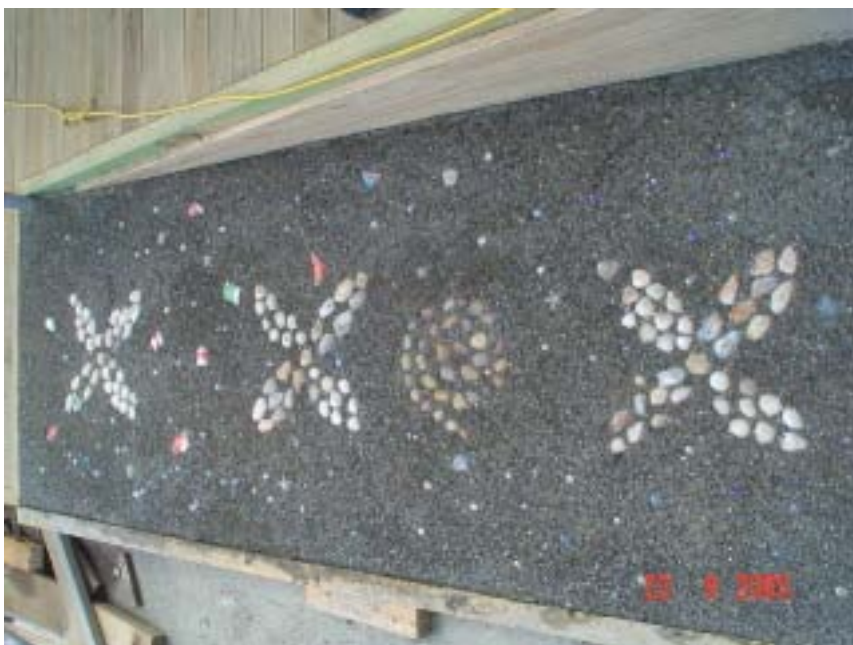
Photo 6: Tools and artefacts: The ramp into the over-2s building, showing shell patterns that reflect a traditional Samoan design.