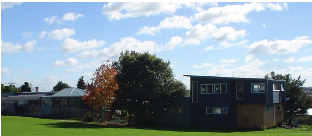
Photo 3: The A'oga Fa'a Samoa 2006, showing the meeting room (upstairs at right) and the new foyer area.

More recent developments to the site have been the wonderful meeting and work room built when the A'oga Fa'a Samoa became a centre of innovation. The entrance way and new foyer in the over-2 area has been changed, with plans to renovate the toilet laundry area now underway.