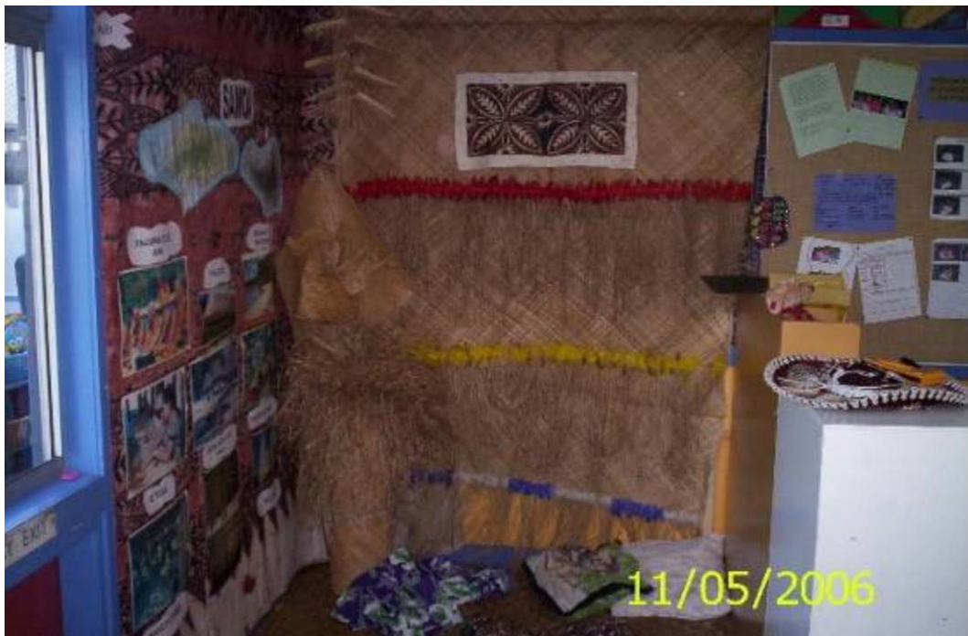
Photo 5: Tools and artefacts: A “Samoan corner” in the over-2s building at the A’oga Fa’a Samoa.